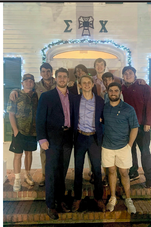
Our executive committee members.