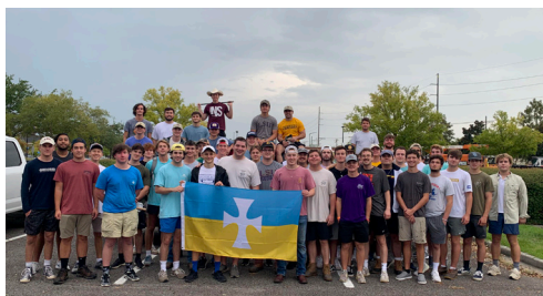
Gamma Iota and Lambda Psi brothers took a joint service trip to Luling, Louisiana, to help those affected by Hurricane Ida.

At the end of October, the chapter hosted its first-ever Halloween party, "The Haunted House of the Southern Woods." The party featured a live band in the backyard and a DJ in the chapter room. It was the talk of campus for several weeks.