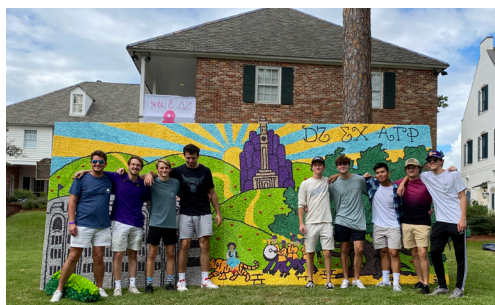
Gamma Iota brothers, who were partnered with DZ, line up in front of the chapter's homecoming banner.