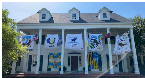
Our Derby Days banners on display at the house in March 2021.

In the fall of 2021, the Gamma Iota Chapter of Sigma Chi continued to build and strive at LSU. When recruitment concluded in late August, we welcomed 52 pledges—the largest class since our recolonization in 2019 and the third-largest pledge class out of all 18 fraternities on campus.